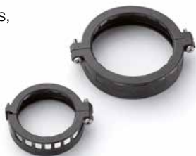
POLO-KAL NG ASV